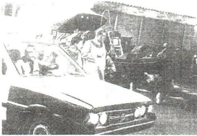
Figure (1): Carrying car (Hantor car) working horse.