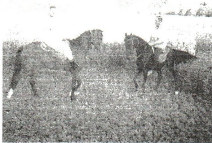
Figure (2): Horse kept at field a way from high ways (control group).