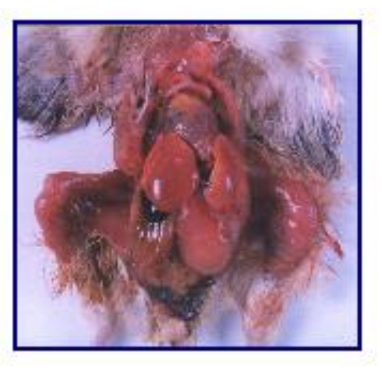
Fig. (2) : Congestion of the carcasses