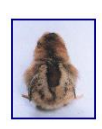
Fig. (1) : Chick is sitting on hocks