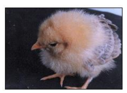
Fig. (5) : Mild swollen of the head in the orally infected chick