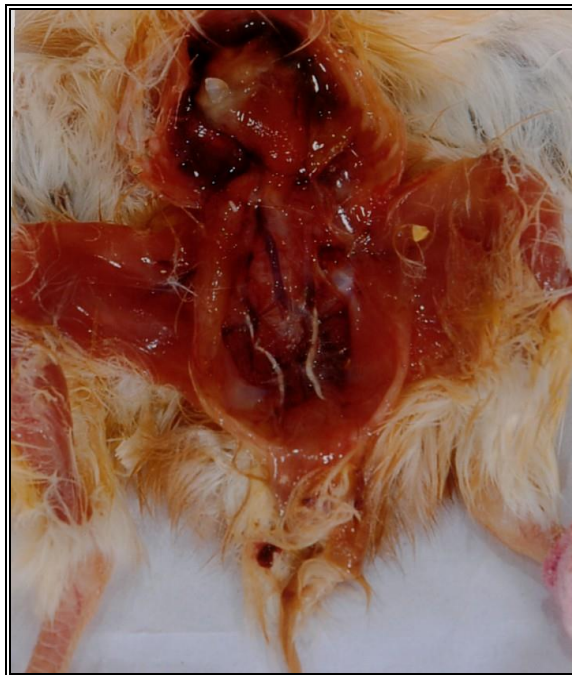
Fig. (7) : Congestion of kidneys with precipitation of urates in the ureters