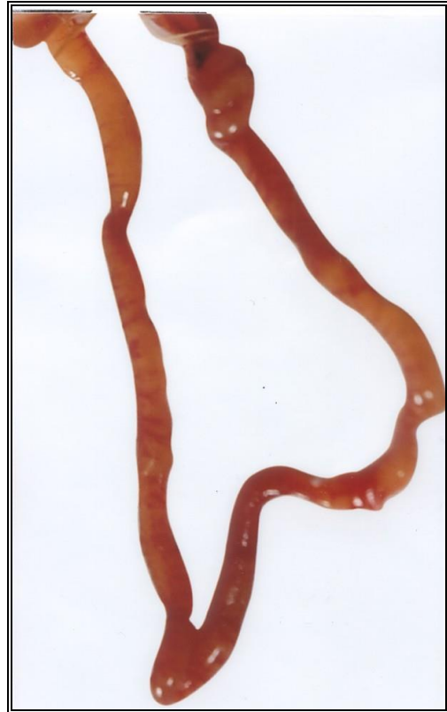
Fig. (5): Shows enteritis