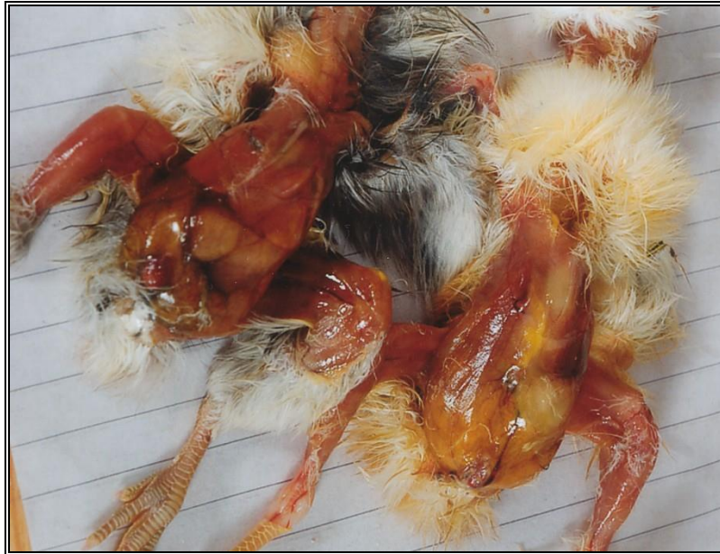
Fig. (2): Shows congestion of all carcass