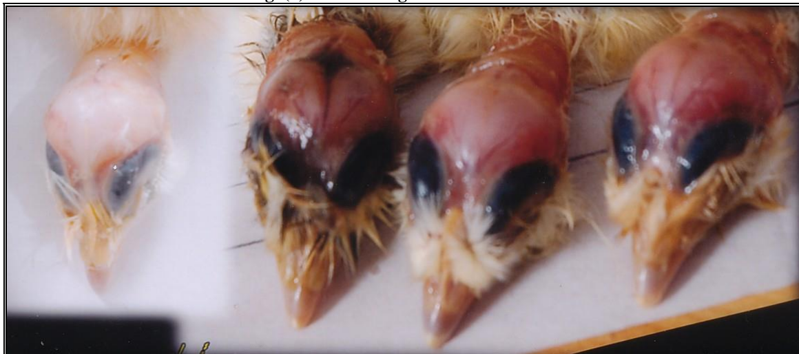
Fig. (3): Petechial haemorrhages in brains of experimentally infected chicks