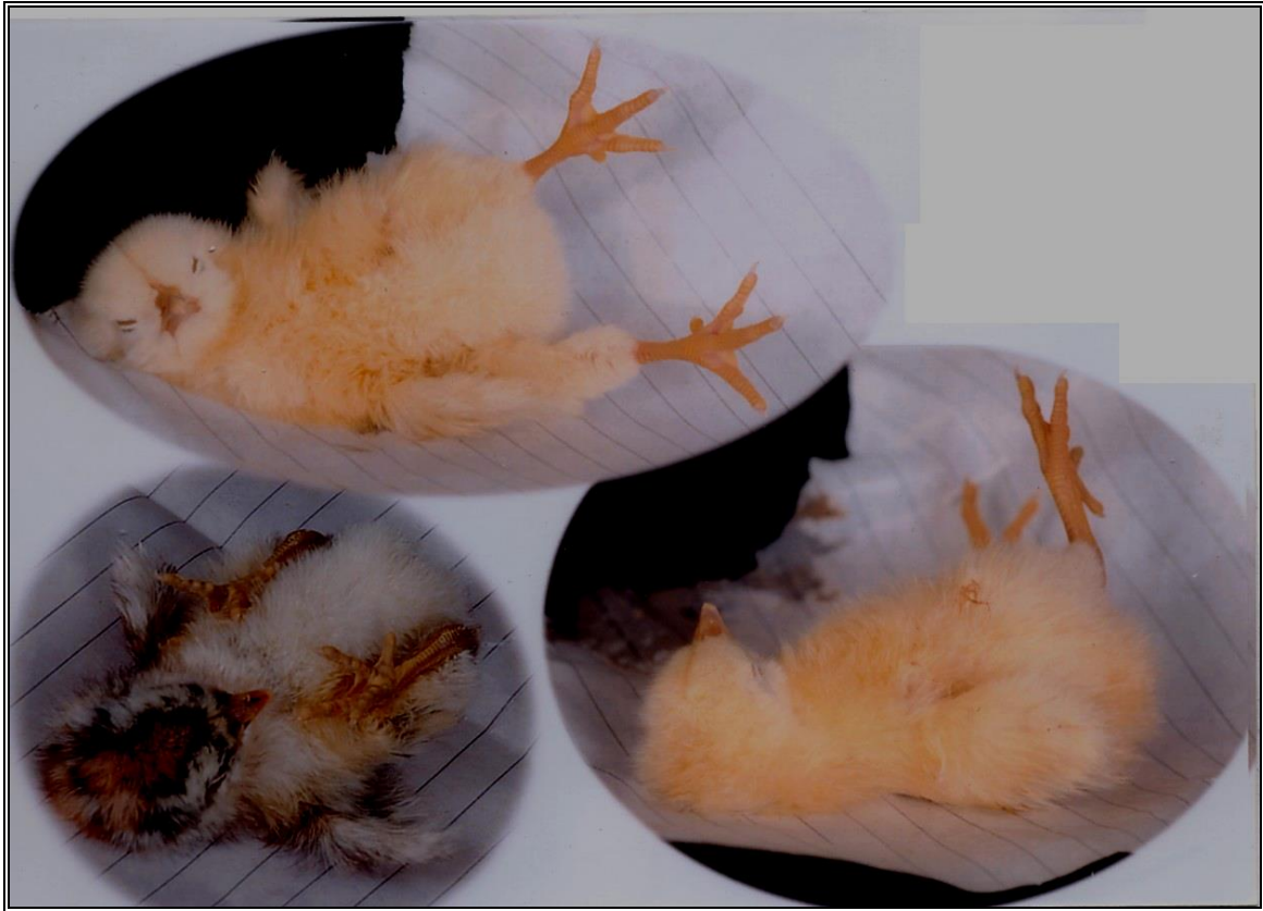
Fig. (6): Experimental infected chicks showed nervous signs