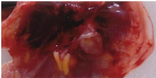
Fig. (3): Showing congestion of lungs