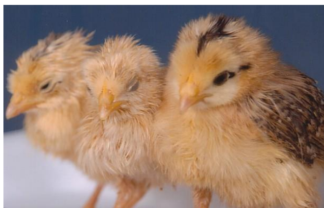
Fig. (1): Experimentally infected chicks with the isolated Staph. hyicus showing depression and eye affection